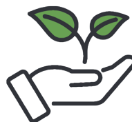
Rebuilds soil structure and fertility