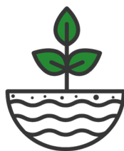
Holds 100% of its own weight in water