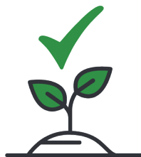
Certified Organic Compost

SOFT Compost is a unique blend of Compost and Biochar designed to stimulate soil biology and plant nutrient availability.